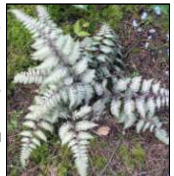
Japanese Painted Fern

We are all looking forward to the beauty that spring and beautiful plants brings to the lake!