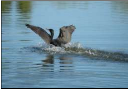
A cormorant landing in the water

The best of both worlds is when the eagles and ospreys hunt the same territory simultaneously. A fight nearly always ensues. They are mortal enemies and do not tolerate shared space.