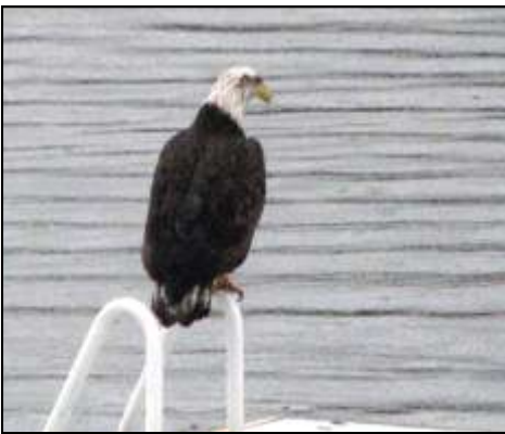
of bald eagle perched on floating dock

I have seen a very hungry eagle corral about eight coots under a dock and then hop around trying to panic them into a mistake for nearly an hour. Coots one, eagle zero. I also saw an eagle dive-bomb Canada geese. These geese actually can dive under water and swim when they have to. Finally, the eagle realized this food was too big and gave up.