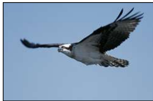
Osprey ( Pandion haliaetus )

Osprey, "the other eagles" on the lake, are more likely to be seen between spring and fall. They eat only fish and are good at what they do, which is attacking their chosen target from on high by a fast dive which plunges them into the water. Their specialized wings pull them out of the water with ease. Once having seen this feat, you never forget it. At first, the hunter flies high over the water, circling in random patterns. Sometimes these big birds are observed by their tiny peep-peep-peep sound that belies their large size. Hearing this call alerts you to note a bird hunting so high as to seem impossibly ineffective. Here is the true marvel of this fish eater. As soon as a possible target is seen, the hunter hovers over one spot until a decision is made to dive or move on. A half dive is often seen as the bird aborts the assault midway to the water for whatever reason. When the full dive option is implemented, it is fast. The bird doesn't always score a meal but keep watching and you probably will see a kill before too long. The successful dive gets a fish which is turned fore-and-aft (head always forward) to be transported immediately to the nest. On the other hand, eagles carry their fish athwart ship (right angles to the body) when flying.