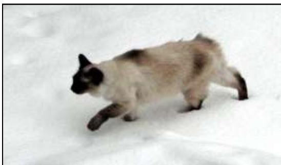
Yoda stalking and looking like eagle food.

couple of years ago, I noted a record of six eagles and three ospreys over the lake at the same time. War was inevitable. One of the ospreys eventually caught a fish and three juvenile eagles decided to attack. The osprey easily outmaneuvered the trio but could not outpace the group because of the heavy catch, which he refused to release. The threesome took turns diving and harassing the smaller bird, coming perilously close several times. They were like a pack of wolves in this life-or-death drama. They were less agile but would come in from different directions. The osprey could have simply let the fish go and fly away, but chose to persist in this game until he nearly lost his life. Only then did he drop the prize and bolt. Normally, one of the eagles would have retrieved the lost fish, but this group wanted blood and continued to chase their enemy until it became obvious that there was no way of stopping this speedster now. That poor fish died only to serve as a backdrop for a seldom seen interaction between our wonderful raptors. Days like that make it worthwhile to have a dear pet at risk by predation. We pay a price for the privilege of living here, but I wouldn't change a thing about this place (now, about those cormorants...).